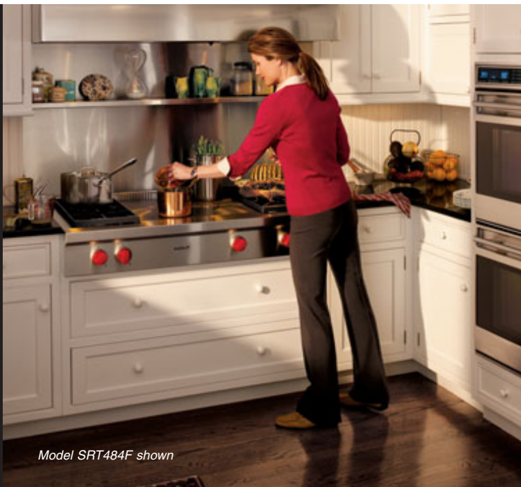
Model SRT484F shown

The patented, dual-stacked sealed gas burners of our new sealed burner rangetop take control to a new level. Two levels, really. The upper-tier burner delivers maximum heat transfer at higher settings; the lower-tier continuous flame ably handles the subtleties of simmering and melting. The Wolf exclusive infrared charbroiler, infrared griddle and French Top ensure this rangetop stands out from the rest in performance and also beauty.